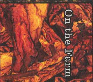
On the Farm