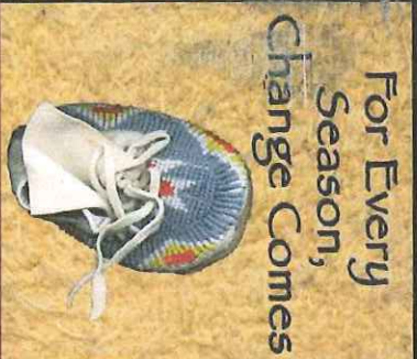
For Every Season, Change Comes